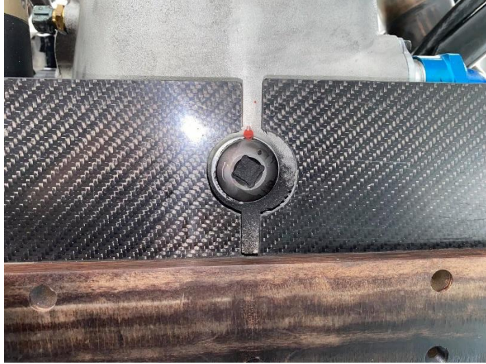
FIGURE 3. SUMP PLUG ACCESS HOLE

Any questions please contact s5000@grmotorsport.com.au